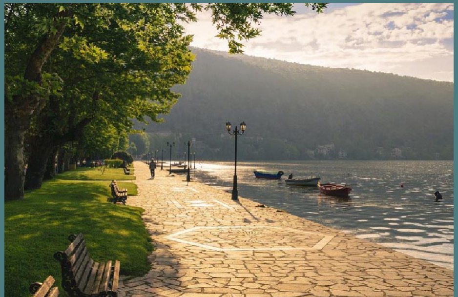
City of Kastoria, Greece

Kastoria: is a city in northern Greece in the region of Western Macedonia. It is the capital of Kastoria regional unit. It is situated on a promontory on the western shore of Lake Orestiada, in a valley surrounded by limestone mountains. The city is known for its many Byzantine churches. Kastoria is an important religious center. It originally had 72 Byzantine and medieval churches, of which 54 have survived.