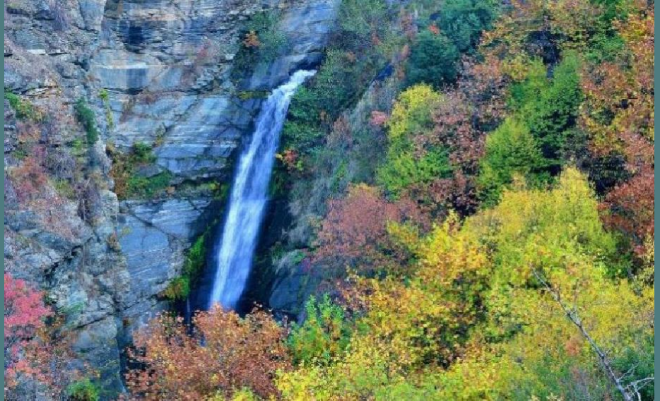
Gorge "of the nine Pierian Muses"

Kastoria: is a city in northern Greece in the region of Western Macedonia. It is the capital of Kastoria regional unit. It is situated on a promontory on the western shore of Lake Orestiada, in a valley surrounded by limestone mountains. The city is known for its many Byzantine churches. Kastoria is an important religious center. It originally had 72 Byzantine and medieval churches, of which 54 have survived.