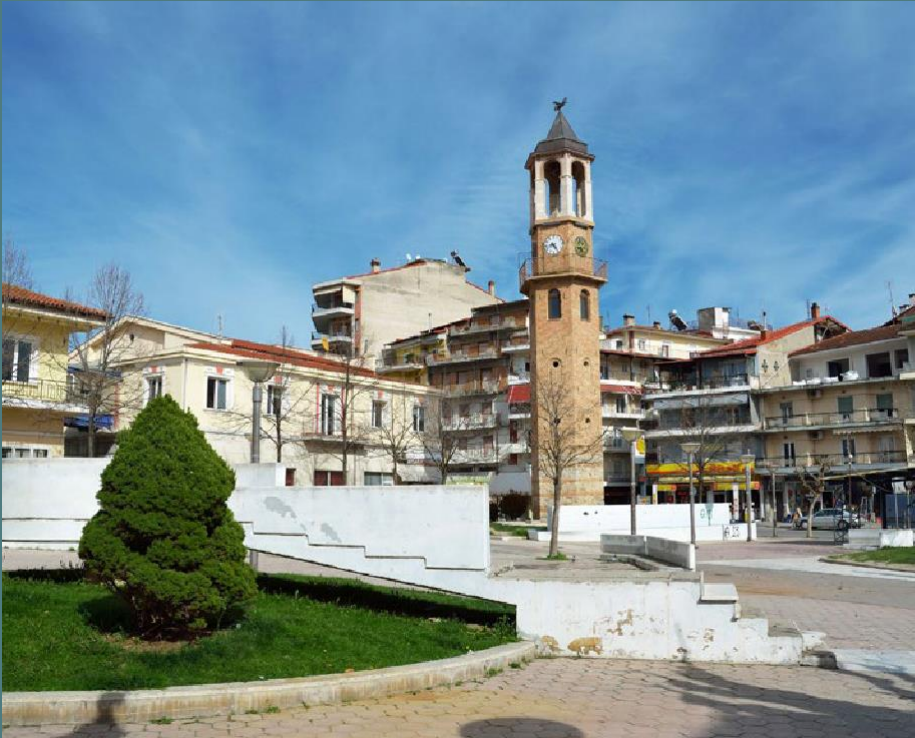
City of Grevena, Greece

The National Park of Valia Caldera, the Vasilitsa Ski Resort and the many different types of mushrooms that can be found there make Grevena a pole of attraction for nature and mountain lovers.